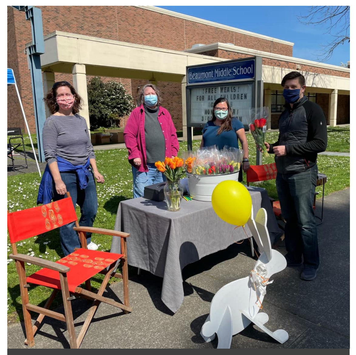
Tulip Sale a success!! A huge thank you to everyone who came out to support the Beaumont Tulip Sale! We sold out in record time and made more than $800 for the Beaumont PTA. Many thanks to all the volunteers and to everyone who helped make this event such a success!